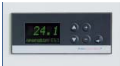
Control panel MINCONTROL*